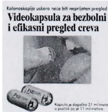
Figure 4: Bowel cancer

In order to prevent bowel cancer VIDEOCAPSULE is used. After it is swallowed with a glass of water, the capsule with cameras passes through the entire intestinal tract. After a few minutes the capsule turns off to save battery and turns on after an hour and 45 minutes, as it needs to reach the intestine. At this point it begins to send four images per second to a small receiver that patient carries.