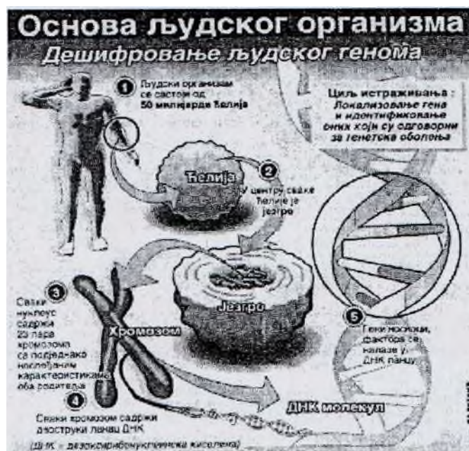
Figure 2: Basis of the human body