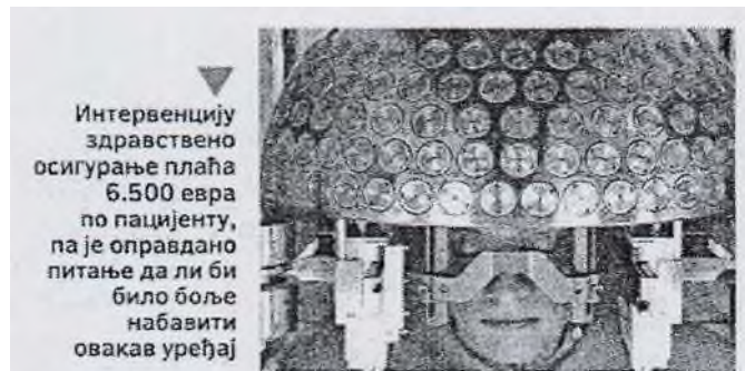
Figure 6: Brain cancer-” GAMMA KNIFE”

This device “gamma knife - helmet” with a greater number of symmetrical round holes, through which rays penetrate, which very precisely radiate and remove tumors, is placed on the patient's head.