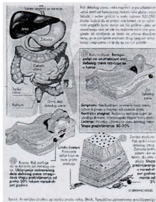
Figure 5: Colon cancer

Screening tests are used to detect the presence of occlus, blood in the stool invisible to the eye, which may be an early sign of malignant diseases of the colon.