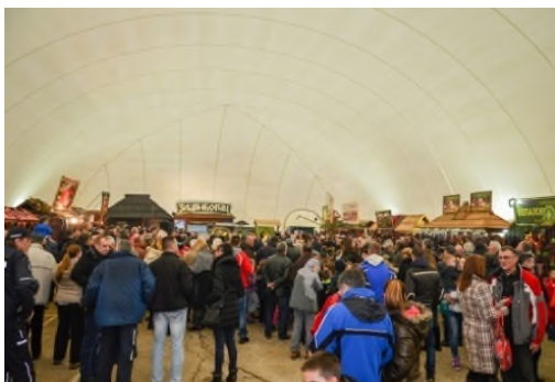
Picture 5. Visitors to the 2017 Fair

It mentions new tourist products, and when the development of the material base of rural tourism in terms of accommodation is added, it is concluded that "Pršutijada" was the remaining locomotive of the tourist development of the destination Mačkat. In addition to this, it should be added that, among other things, the village tourist household "Šopalović", besides tourists who come to Mačkat for rest, has capacities that are able to accept a smaller group and a frequent target group are business people who are held here for their needs smaller Seminars and lectures.