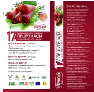
Picture 2: Call for Fair 2017 with the program and list of participants

Planning a particular event is always oriented to the future, which focuses on the goals and means of achieving them. Similar to any other process of problem solving, planning can be conceived as a series of steps that represent a systematic flow.